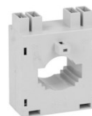
Current trasformers DM2T0400